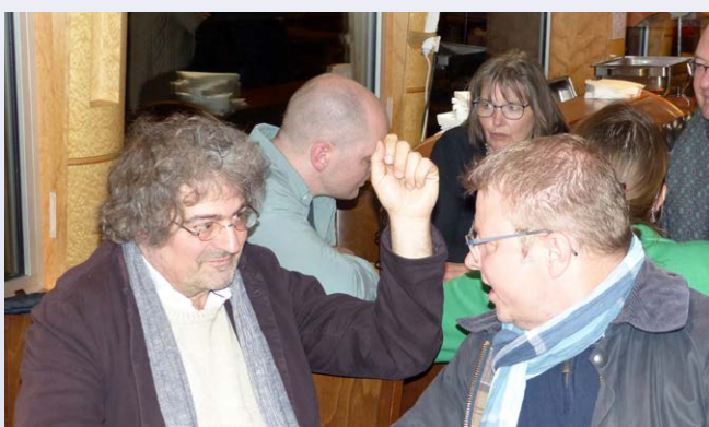
Discussions in the evening, Spring Conference 2024