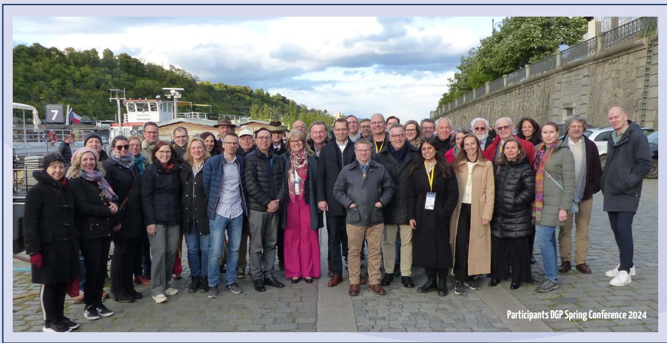
Participants DGP Spring Conference 2024