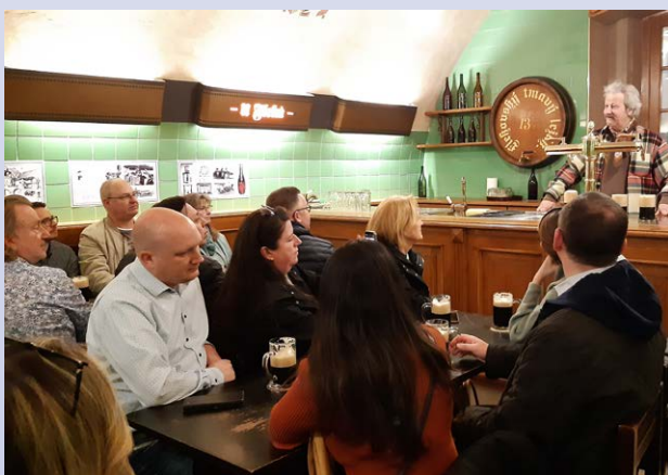
Brewery tour, Spring Conference 2024