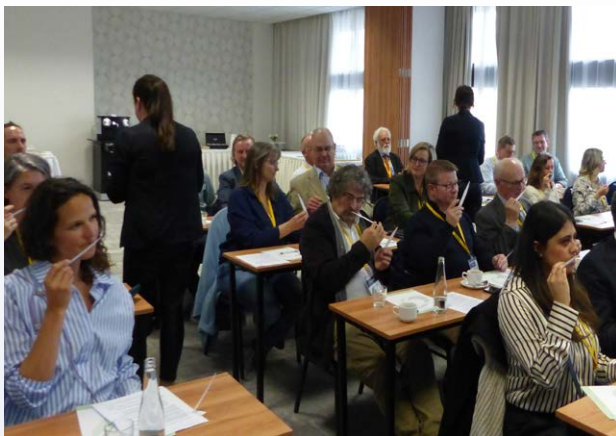
Scent sample, Spring Conference 2024

Similarly critical is the appreciation of nature itself and the awareness that natural resources can also be depleted. Cedar forests in Lebanon, redwood forests in North America, sandalwood in India, and rosewood in French Guiana are examples of overexploitation and destruction. Rosewood is virtually no longer used in perfumery, and “Indian” sandalwood ( Santalum album ) now comes from Australia. However, better resource management is preferable to a ban, as there are still large stocks of guaiac (bluewood) from Paraguay.